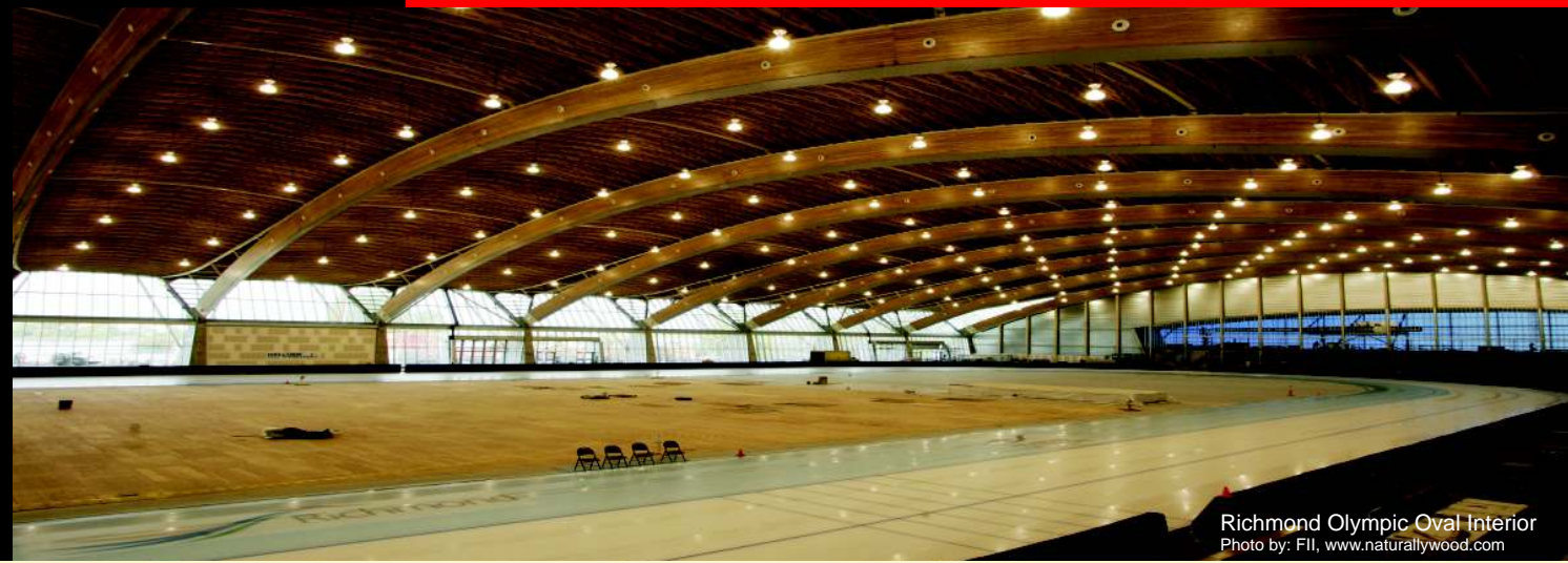
Richmond Olympic Oval Interior

The Richmond Olympic Oval features the world's largest wooden roof (47,526 m 2 ) which is covered by over 19,000 plywood panels bearing CertiWood's CANPLY mark.